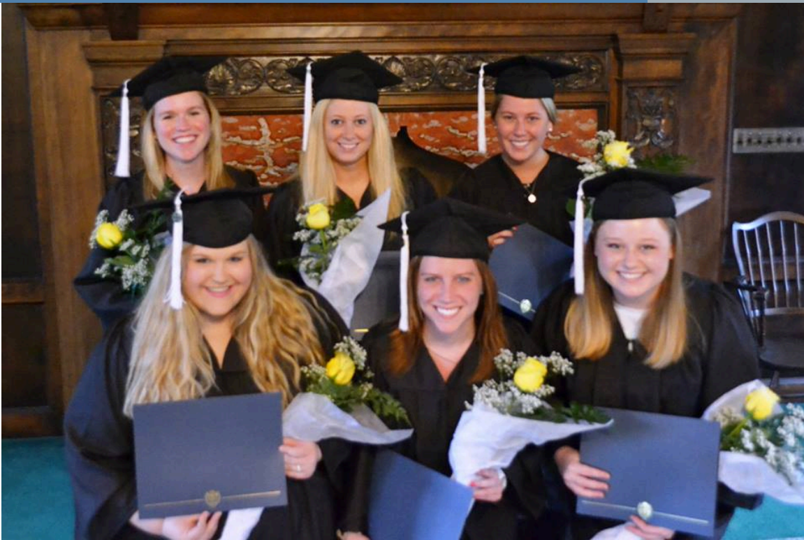
Spring 2014 Gender and Women's Studies minors, hooding ceremony.